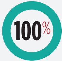
Business Board of Advisors